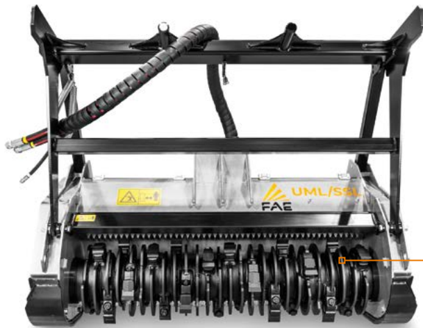
Rotor Bite Limiter